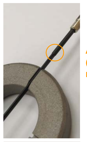
Aero transition (The transition between round and flat diameter.)

Choose the right slot to lay the Aero spoke